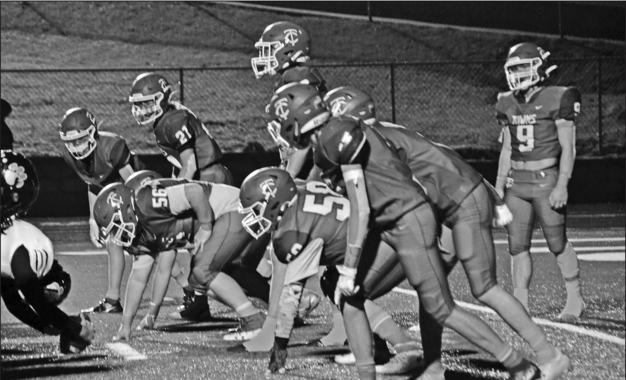
The Towns County special teams prepare to defend a Greene County kick on Friday night in Hiawassee.